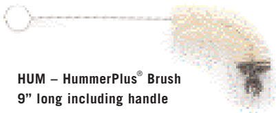
HUM – HummerPlus® Brush 9" long including handle