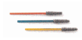
PLB – Perfect Little Brushes Package of 3 Hummer Port Brushes

Replacements for the Hummer Port Brush that is included with all Droll Yankees hummingbird feeders.